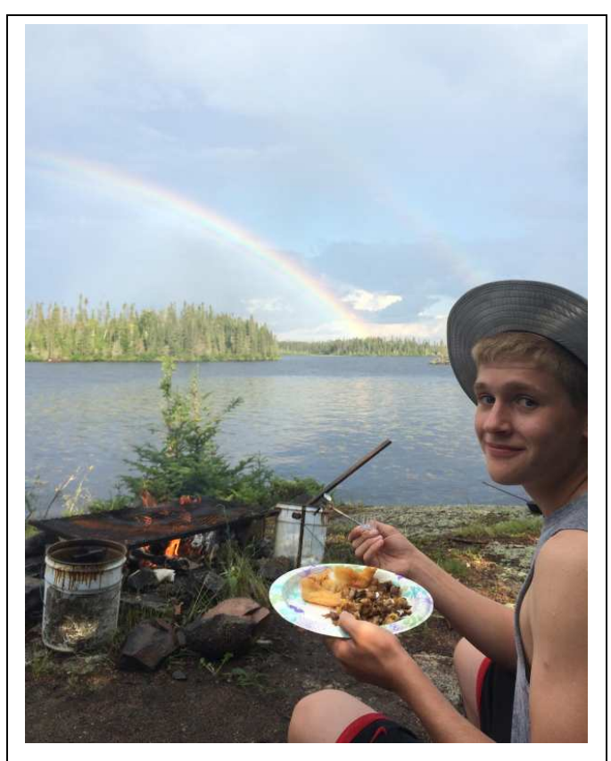
Goose Lake double rainbow at Shore Lunch Island