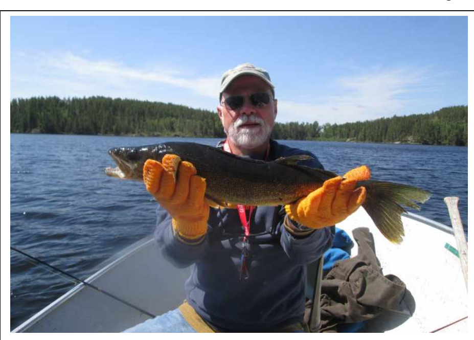
A 26.5 inch Walleye from Unnamed Lake June 14-21