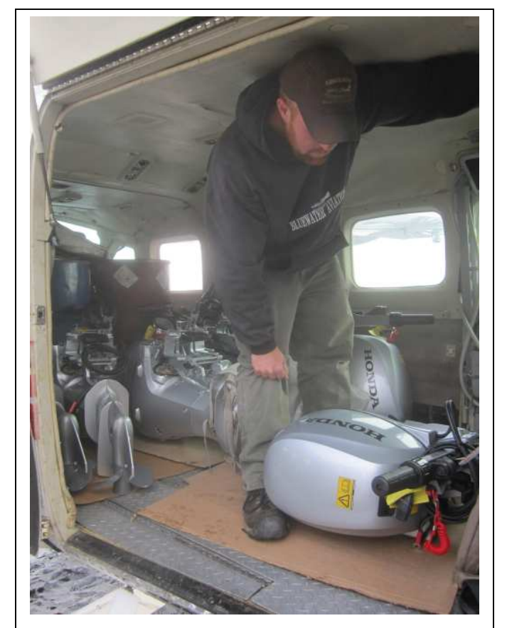
New Honda electric start motors for Goose Lake in 2016