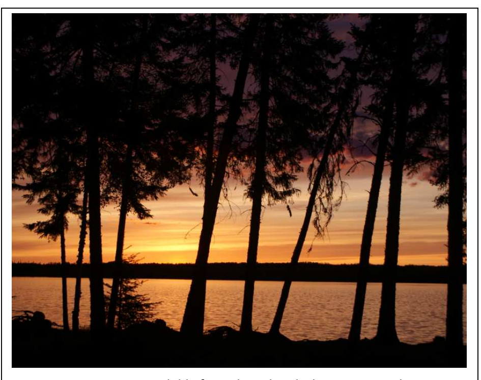
Sunsets are available from the cabin decks at Goose Lake most every evening.