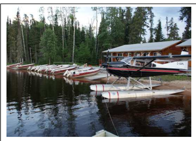
Last shot of the fleet of Johnson motors. All will be Honda electric start at Goose in 2016