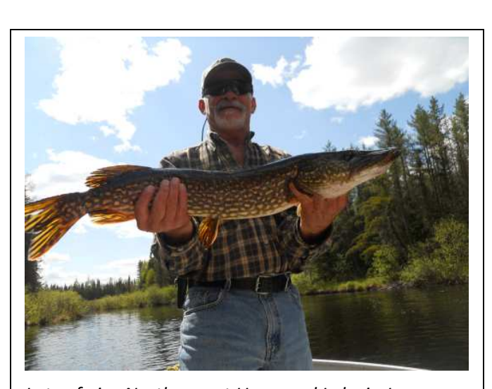
Lots of nice Northerns at Unnamed Lake in June were not listed on the bragging board