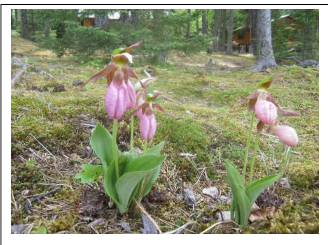
Lady Slippers at Goose Lake